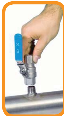
A Screw neck

B Mount spot drilling collar incl. ball valve (see accessories)