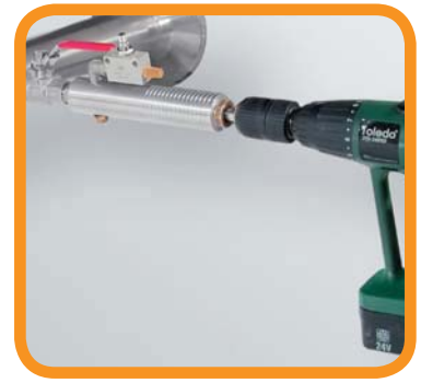
Drilling under pressure

By means of the drilling jig it is possible to drill under pressure through the 1/2" ball valve into the existing pipeline. The drilling chips are collected in a filter. Then the probe can be mounted as described under point A.