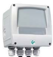
Mains unit in wall housing