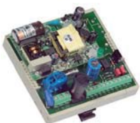
Mains unit on DIN rail