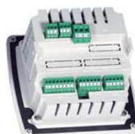
Mains unit in wall housing